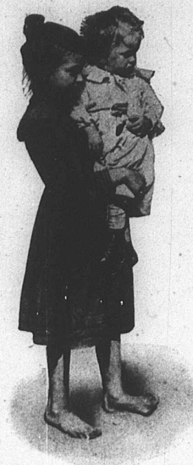
"He ain't heavy—he's my brother."